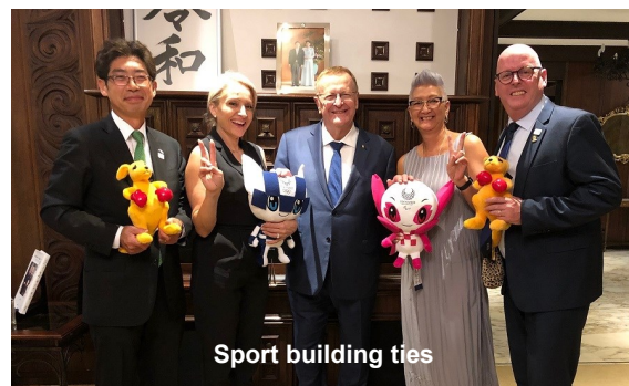
Sport building ties

www.sydney.au.emb-japan.go.jp/itpr_en/about_consul_generals_newsletter.html