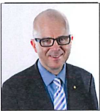
Cr Mark Greenhill OAM Mayor Blue Mountains City Council