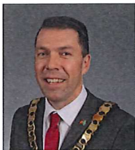
Cr George Brticevic Mayor Campbelltown City Council