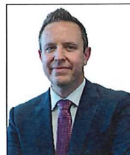
Cr Matthew Deeth Mayor Wollondilly Shire Council