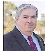
Cr Ross Fowler OAM Mayor Penrith City Council