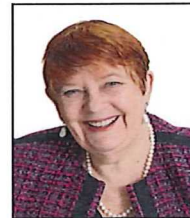
Wendy Waller Mayor Liverpool City Council