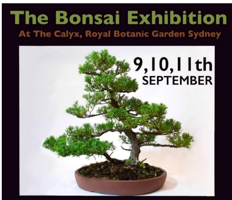
Bonsai Exhibition at the Royal Botanic Garden Sydney (9-11 September 2022)