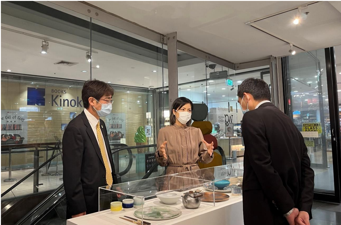
Visiting “The Handcrafted Home” exhibition (9 August 2022)