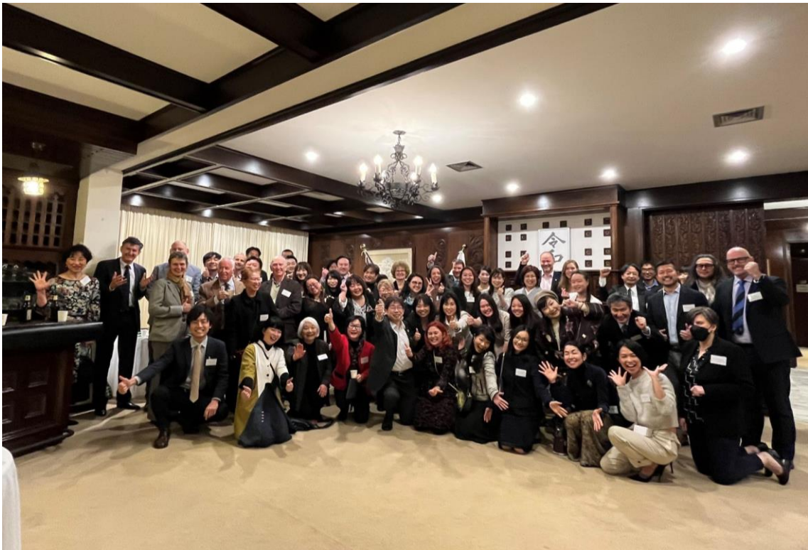
Japanaroo Networking Reception (3 August 2022)

I am hopeful that the friendship and ties between Japan and Australia will deepen further through “Japanaroo” for years to come, for the benefit of Japan, Australia, and the world.