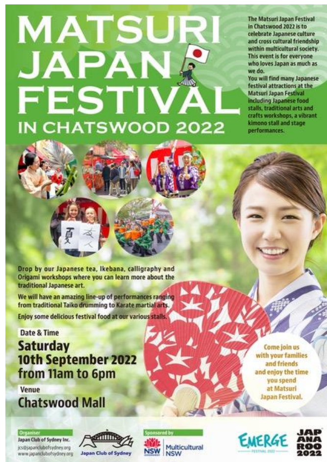
Matsuri Japan Festival in Chatswood 2022 (10 September 2022)

This series of images explains the actual historical facts, including the feelings of the submarine crew and the naval burial after the attack in an easy-to-understand manner. Please take this opportunity to see them.