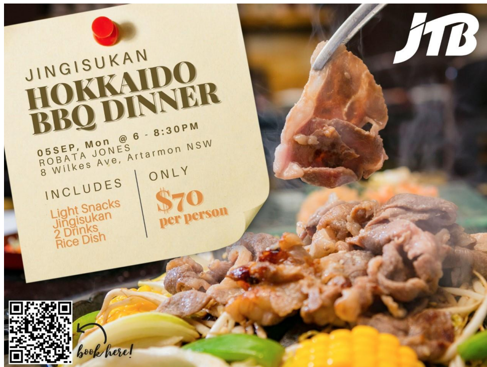
Jingisukan Hokkaido BBQ Night (5 September 2022)