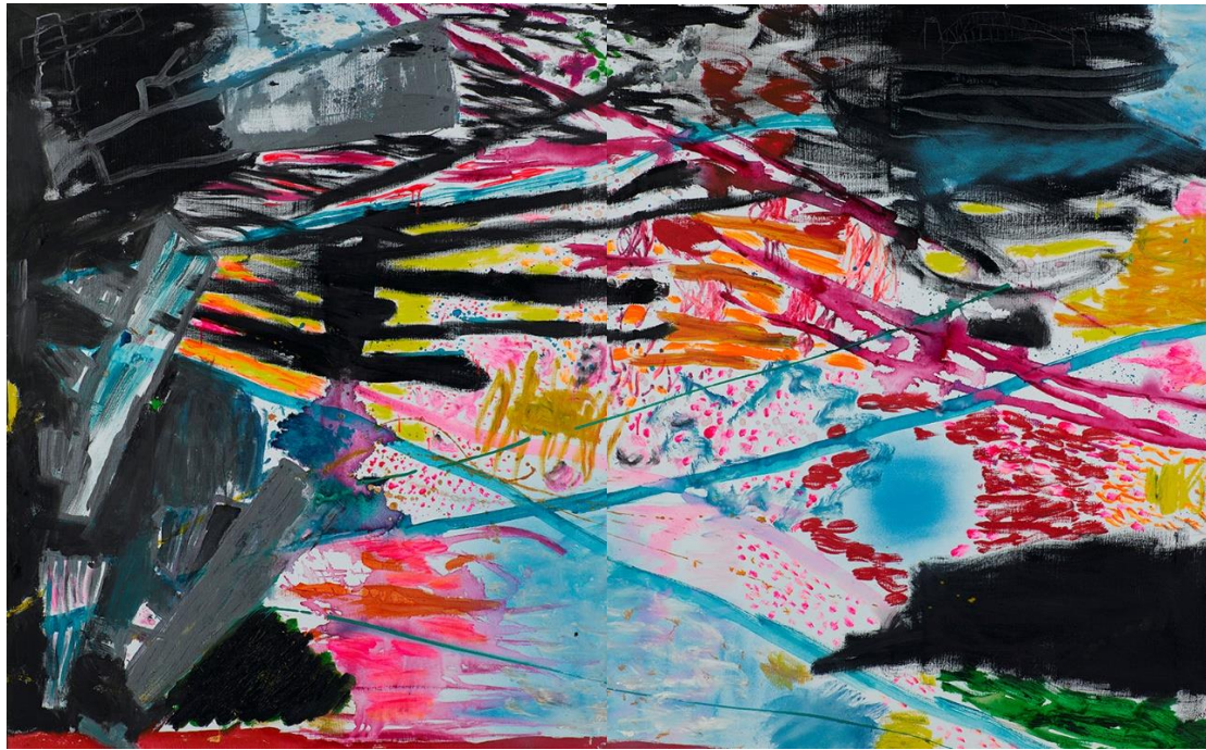
“Attack” – an exhibition by Ken Done (3-11 September 2022)

As far as travel, Kintetsu International Express has Japan Holiday Deals for Groups & Families which can be accessed from Saturday 3 September to Monday 30 January next year.