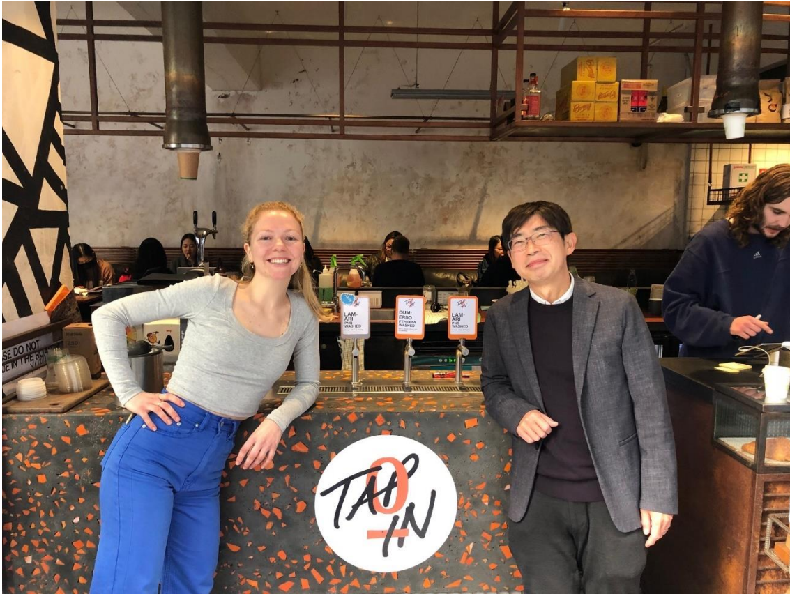
At the main Single O Café in Surry Hills (30 July 2022)

realisation of peace, as the next generation of high school students learn about the history of war at the actual locations of former conflict and through this deepen exchange.