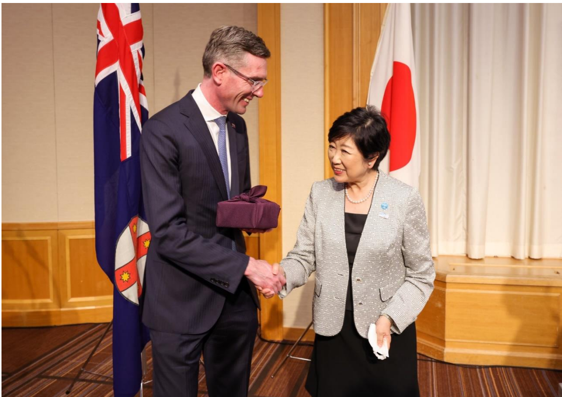
Meeting with Tokyo Governor Koike (21 July 2022, Premier Perrottet's Twitter)

In addition to this, Premier Perrottet had several bilateral meetings. On 22 July, he had a meeting with Hitachi's Vice President and Executive Director in charge of Regional Strategies [APAC] and it was announced that Hitachi would become the first private-sector tenant in the Bradfield City Centre's First Building by establishing the Kyoso (collaborative creation) Centre in 2023 . This is in line with the NSW Government's investment in the Advanced Manufacturing Research Facility (AMRF) in this precinct.