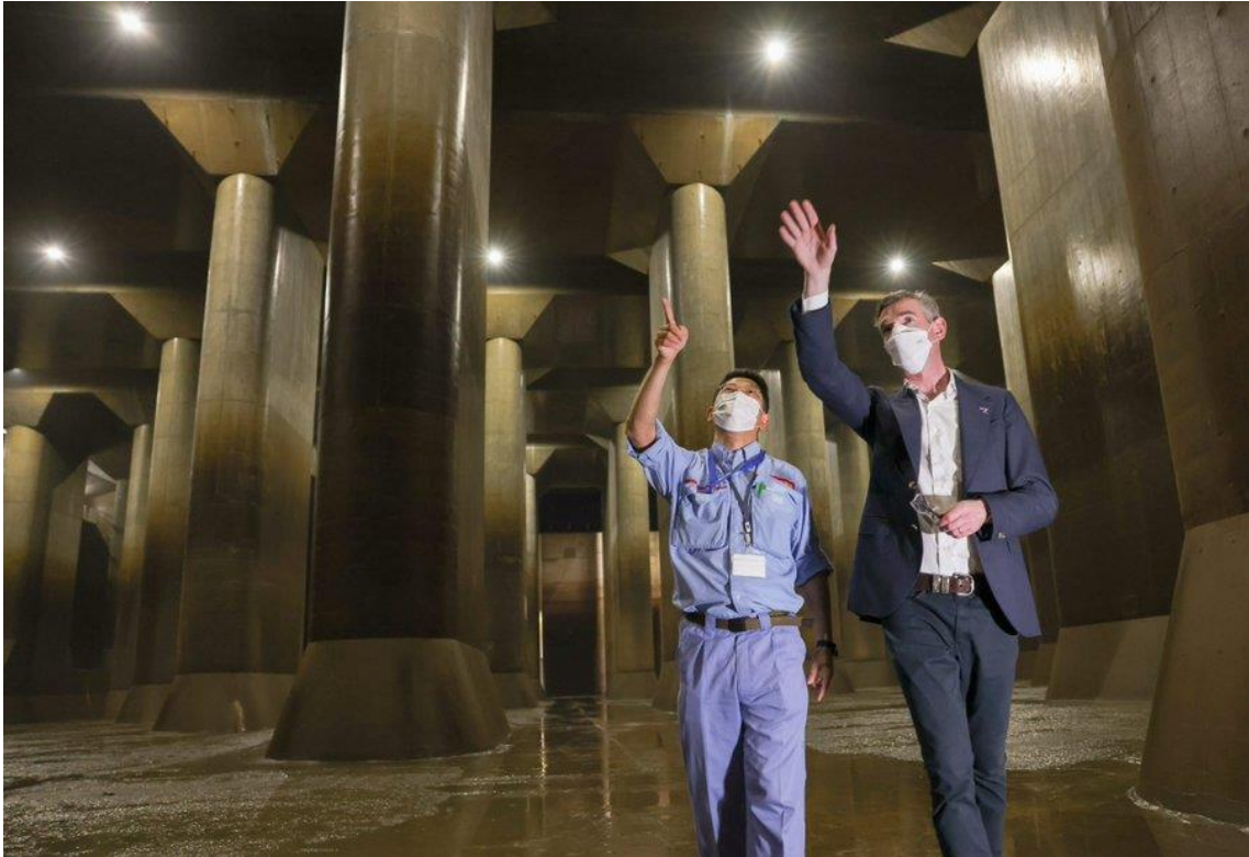
Touring the Metropolitan Area Outer Underground Discharge Channel (24 July 2022, Premier Perrottet's Twitter)