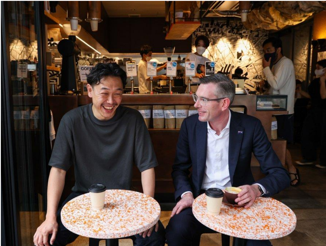
Single O Café (22 July 2022, Premier Perrottet's Twitter)