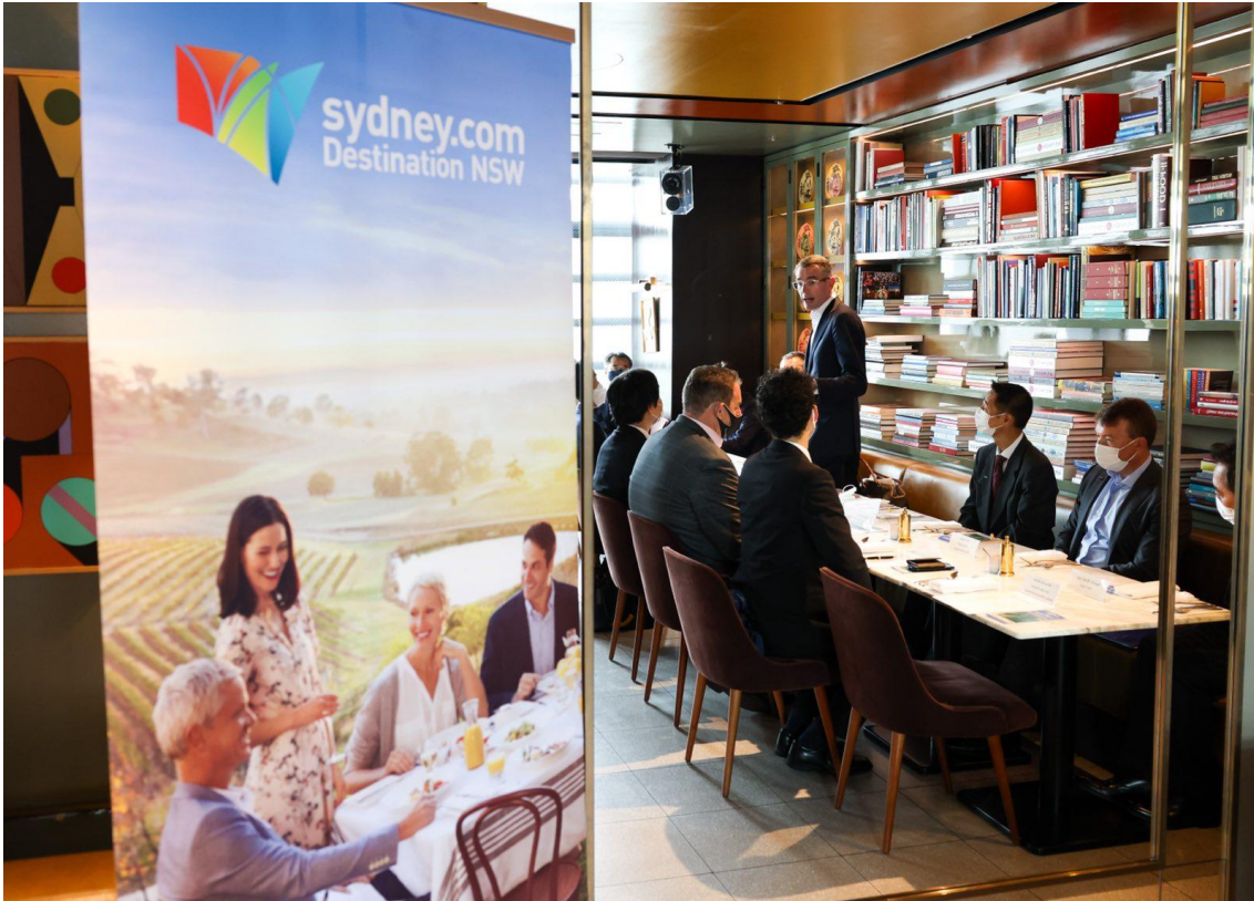
Tourism roundtable (22 July 2022)