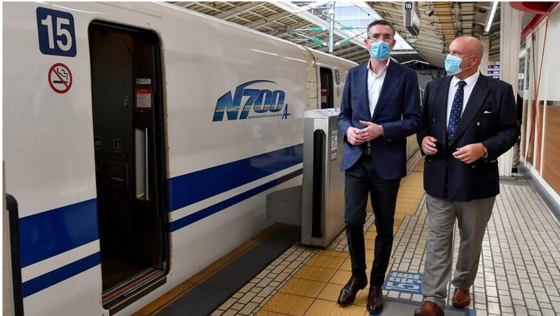
Premier Perrottet and Minister for Transport and Veterans Elliot boarding a shinkansen (23 July 2022,)

From here in Sydney, I would also like to promote the attractions of the Australian lifestyle through shops such as this that enable elements of the Australian lifestyle to be enjoyed even in Japan.