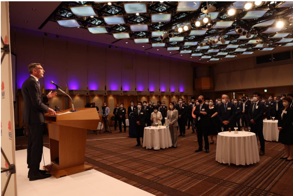
Premier Perrottet’s speech at the NSW Government reception (21 July 2022, Premier Perrottet’s Twitter)

Premier Perrottet stated that NSW’s stronger presence in Japan would deepen relations, accelerate investment and export opportunities, and create opportunities and prosperity.