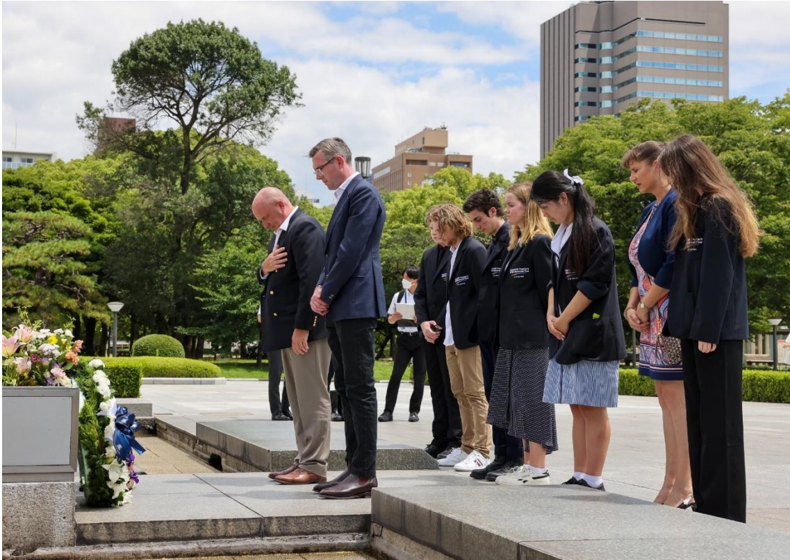
Laying wreaths at the Hiroshima Peace Memorial (23 July 2022,)