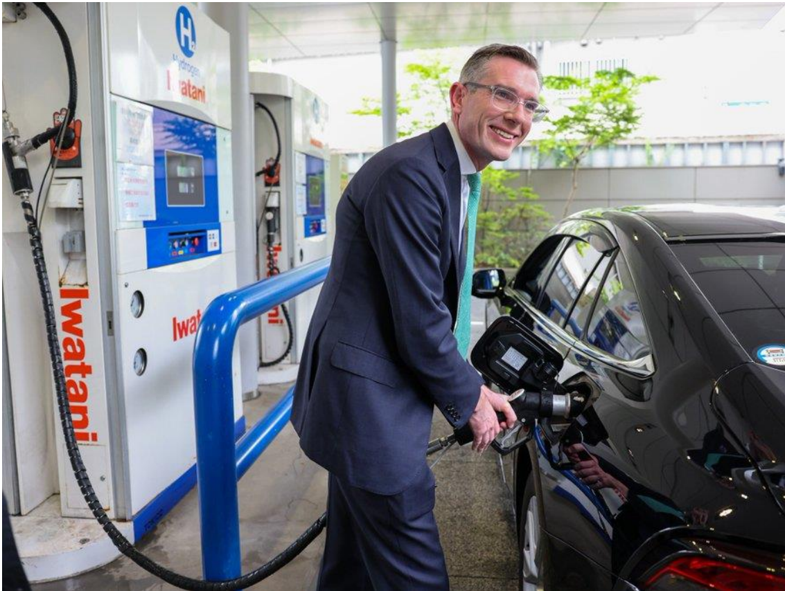
Observing a hydrogen station belonging to Iwatani Corporation (22 July 2022, Premier Perrottet's Twitter)