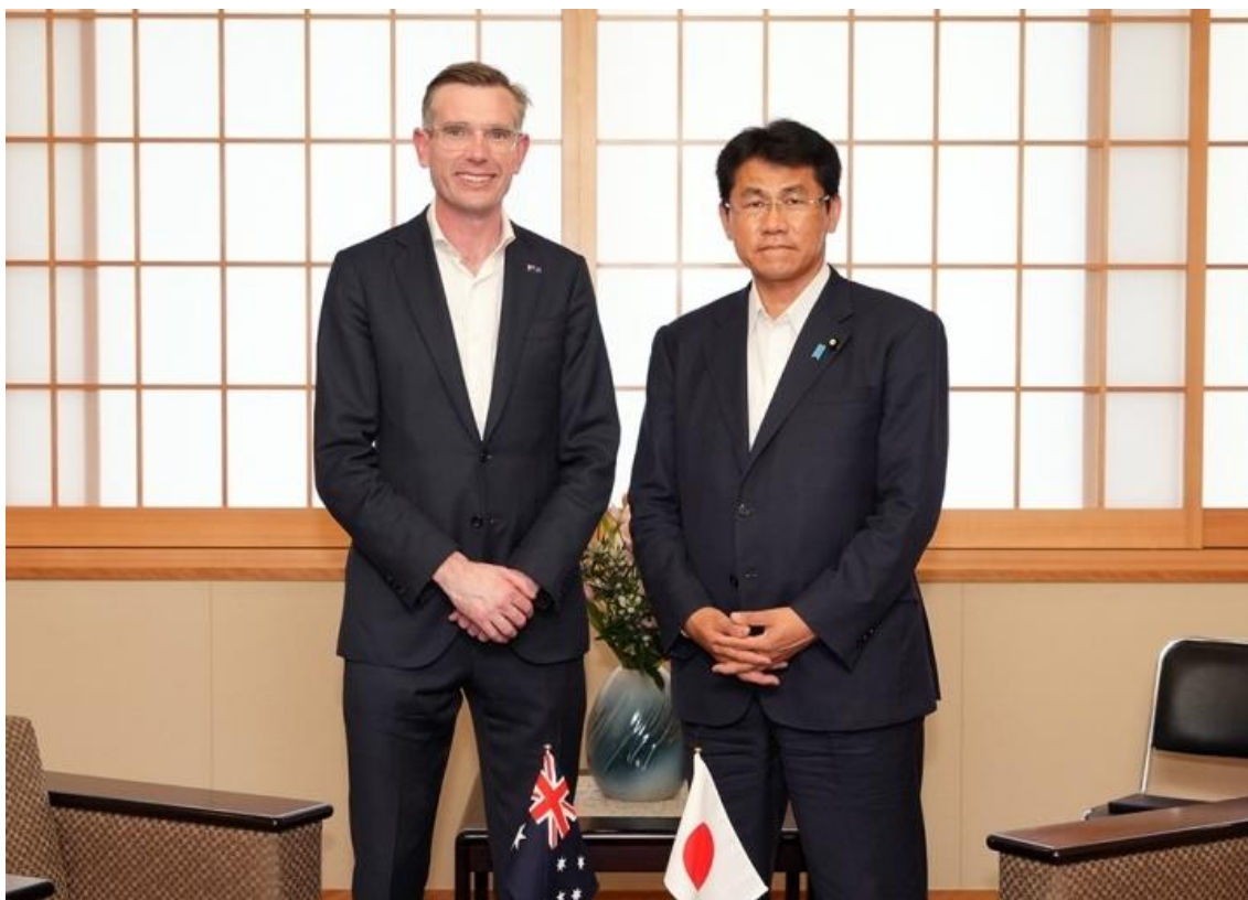
Meeting between Premier Perrottet and Parliamentary Vice-Minister for Foreign Affairs Miyake (22 July 2022)

The Premier of New South Wales, the Hon. Dominic Perrottet MP, visited Japan from 21 to 24 July. It was his first overseas visit since assuming office in October last year. Choosing Japan as his first destination shows the importance he places on Japan. As well as Tokyo, together with a group of NSW high school students he also visited Hiroshima.