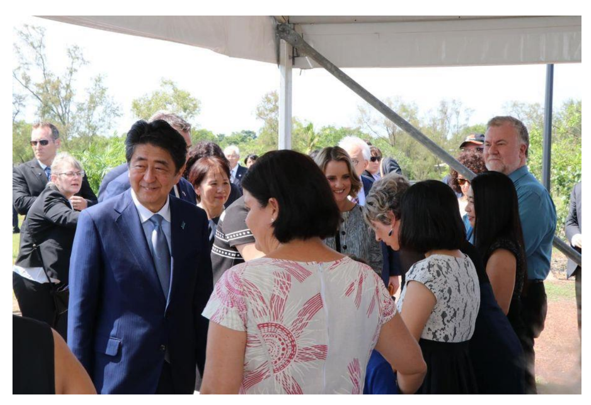
A photo NT Chief Minister Fyles posted to her Facebook with former Prime Minister Abe (photo taken 17 November 2018, posted 8 July 2022)