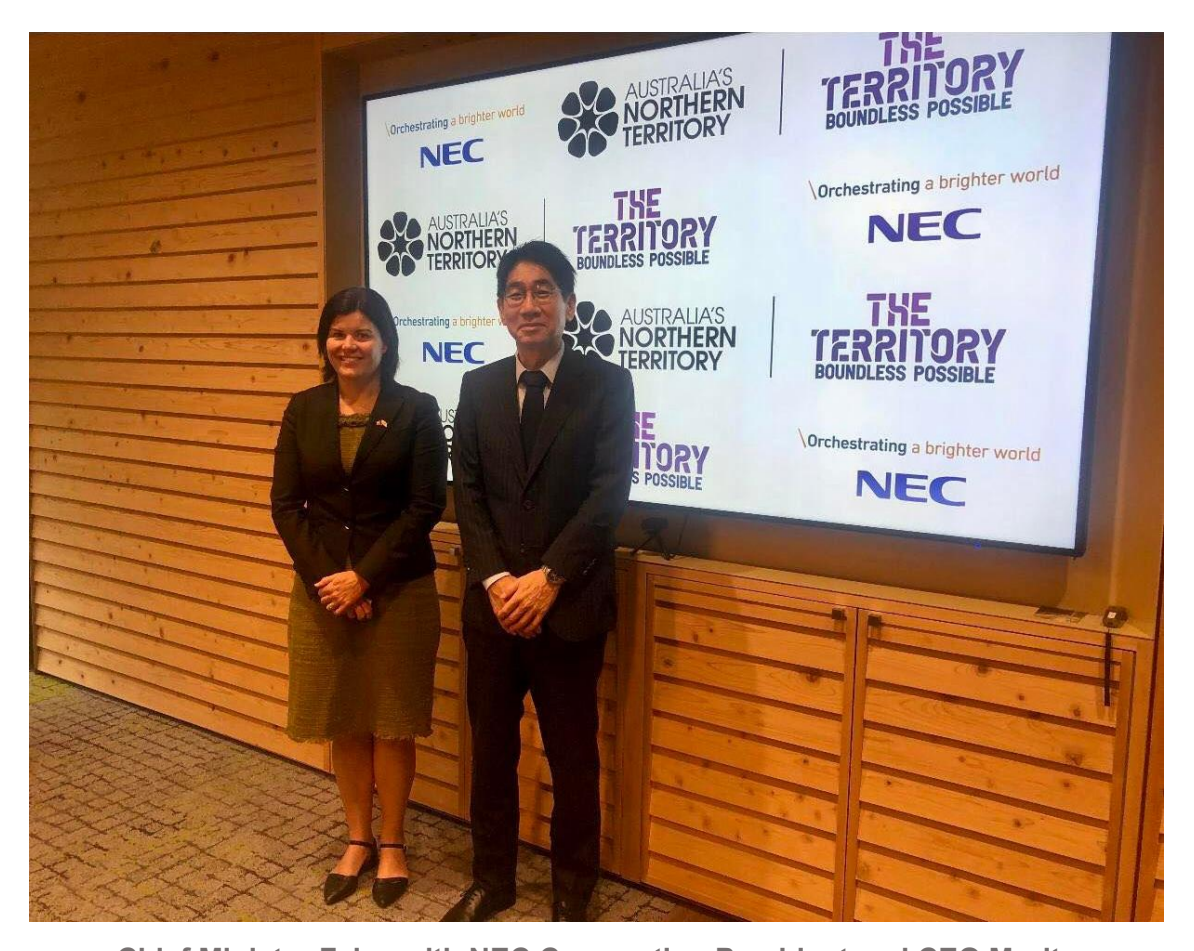
Chief Minister Fyles with NEC Corporation President and CEO Morita (19 July 2022)

Negotiations are due to take place with the goal of increasing LNG production capacity and expanding onshore production facilities, increasing stable and clean energy supply and security for the Asia/Oceania region, promoting the Darwin CCUS hub with INPEX as an operator, improving local skills development and services and supply capability, and establishing renewable energy targets.