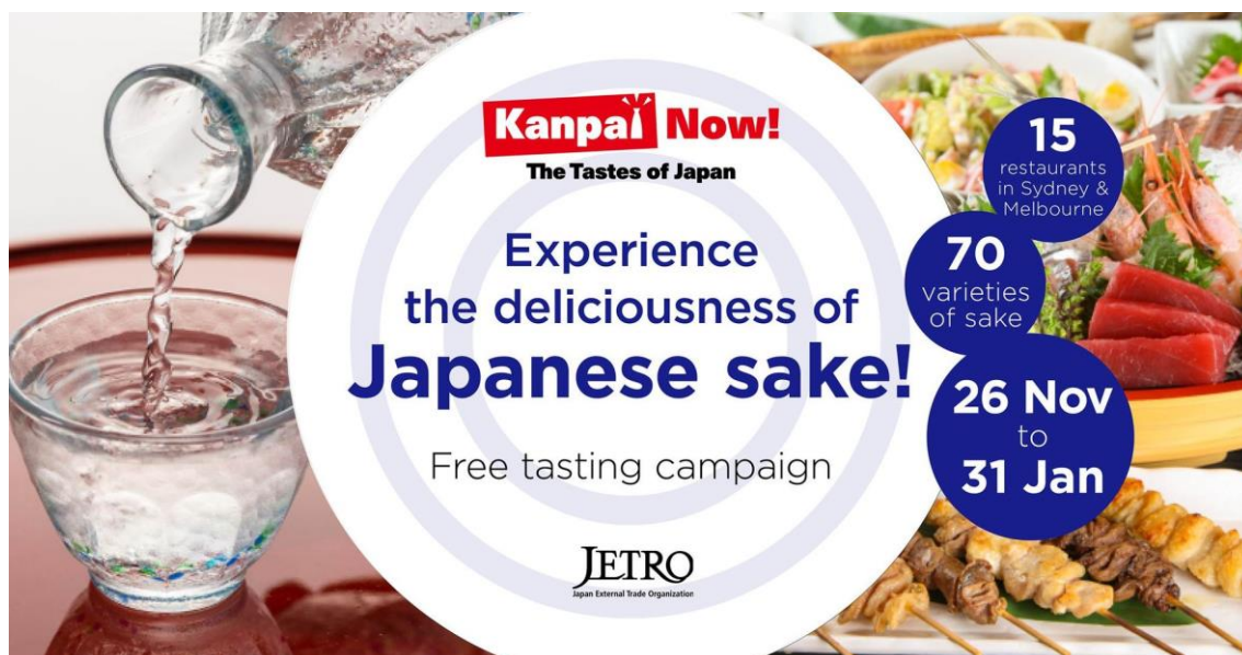
Kanpai Now! Japanese sake free tasting campaign (until the end of January 2022)

Okinawa-related groups are preparing a program to experience Okinawan culture such as Awamori (a local liqueur), Eisa dancing and sanshin music at “Okinawa Night” on Thursday 9 December, and JTB is organising a “Hokkaido Night” program on Sunday 12 and Monday 13 December with “Genghis Khan”, a type of Hokkaido BBQ.