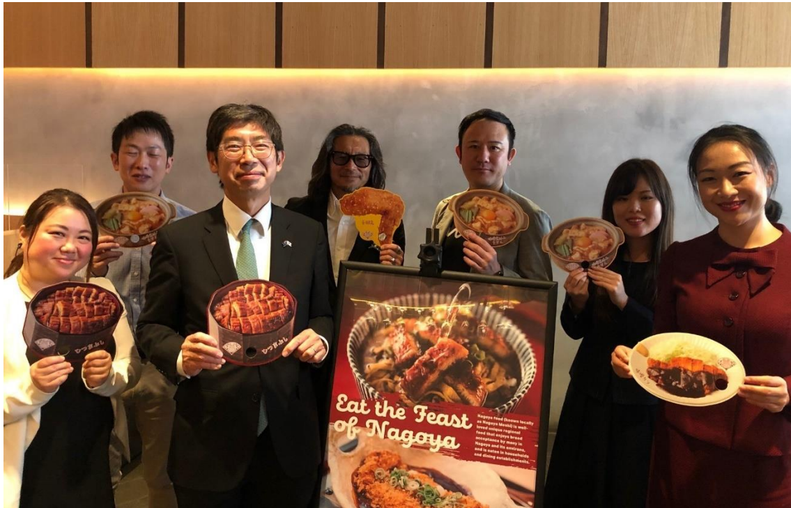
“Eat the Feast of Nagoya” tasting event (29 November 2021)