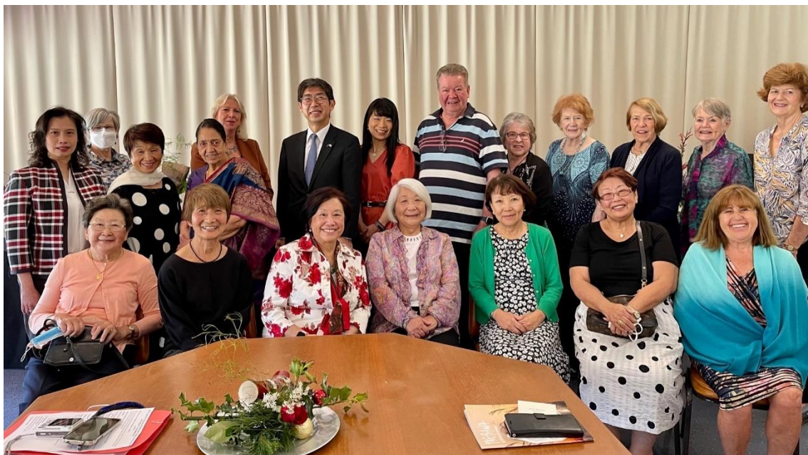
Ikebana International meeting (23 November 2021)