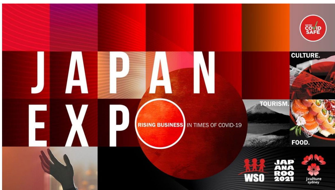
Japan Expo – scheduled for 17 December 2021