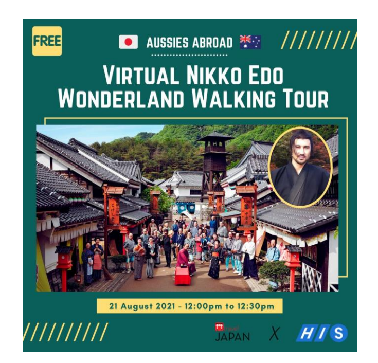
<u>A virtual Nikko Edo Wonderland Walking Tour led by an Aussie Abroad</u> (21 August 2021)