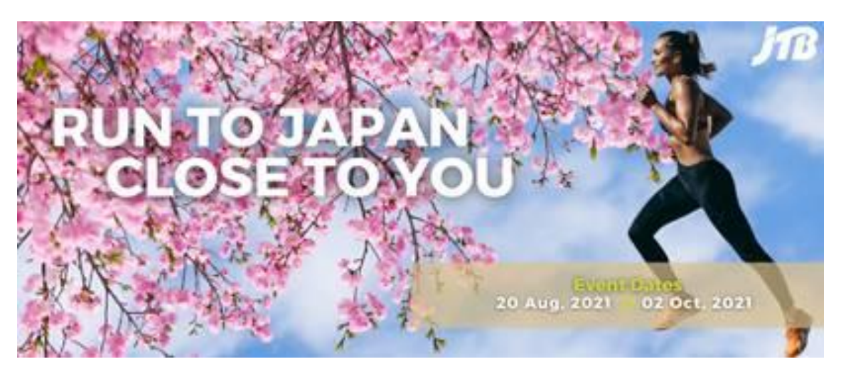
Japanaroo virtual marathon (20 August to 2 October 2021)

And looking ahead to ski tourism recommencing post-COVID, from the end of this year through to next year, WAmazing Snow is offering <u>early-bird ski lift tickets</u>. Enjoy the ski video they've uploaded.