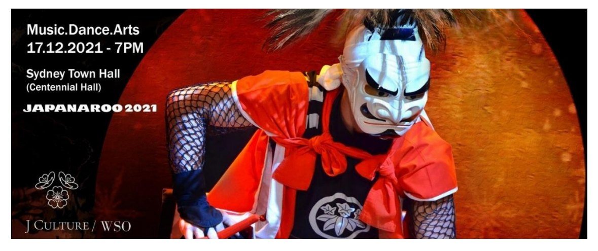
Japanaroo 2021 Festive Season Concert (17 December 2021)