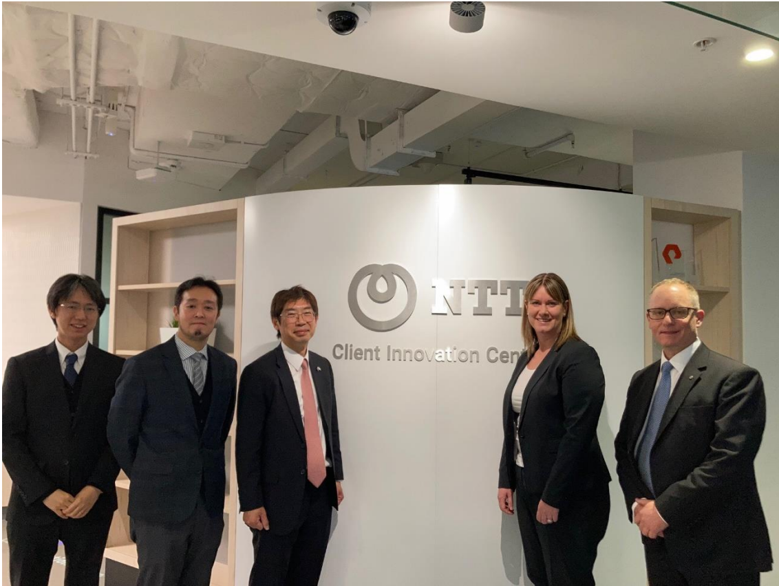
Visit to the NTT Client Innovation Centre (11 June 2021)