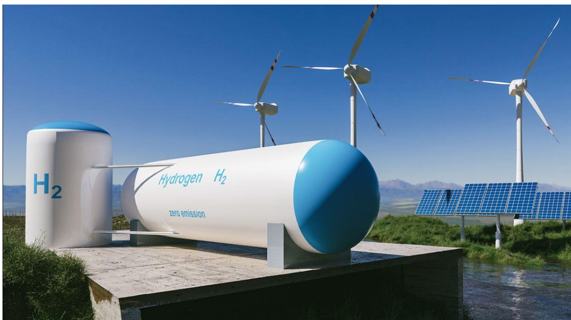
Photo from the invitation to the webinar co-organised by AJBCC and JETRO (scheduled for 10 August 2021)

should work on the maintenance/enhancement of multilateral free trade systems such as the TPP11 and the WTO, as well as strengthening bilateral economic relations such as cooperation towards decarbonisation. They also agreed to promote cooperation between Japan and Australia in a wide range of areas, including cooperation at the OECD and the promotion of digital trade.