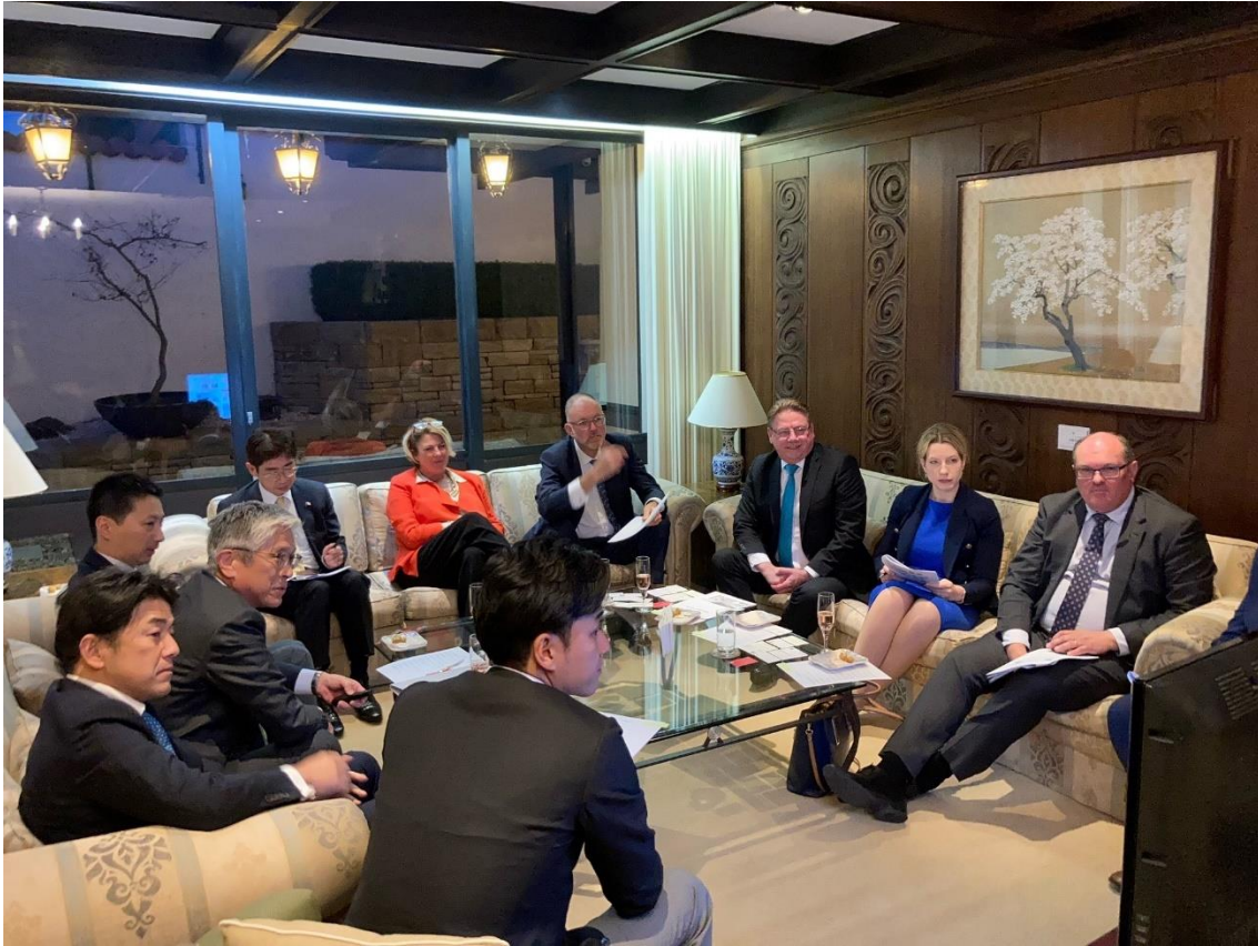
Discussion among Japanese and NSW housing representatives (17 June 2021)

leading technologies through Japan-Australia collaboration in the digital field, and I look forward to future developments.