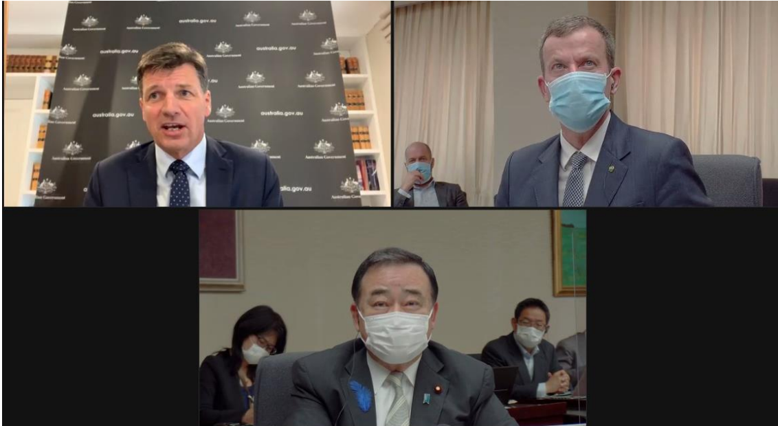
At the Third Japan-Australia Ministerial Economic Dialogue: Angus Taylor (top left), Dan Tehan (top right), and Kajiyama Hiroshi (bottom) (15 July 2021;)