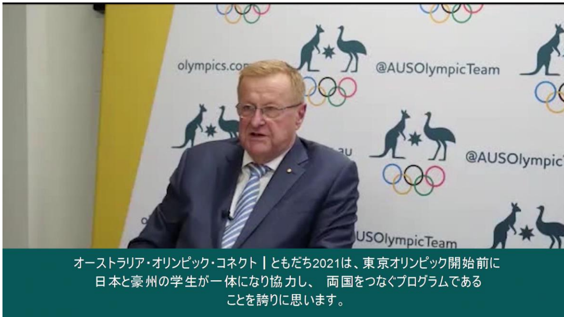
Mr John Coates AC, President of the Australian Olympic Committee (AOC), speaking during the webinar held upon the opening of “Tomodachi 2021” applications (22 February 2021)

weeks. In addition, the AOC will support them by providing a “communication guide” to facilitate smooth planning of exchange activities.