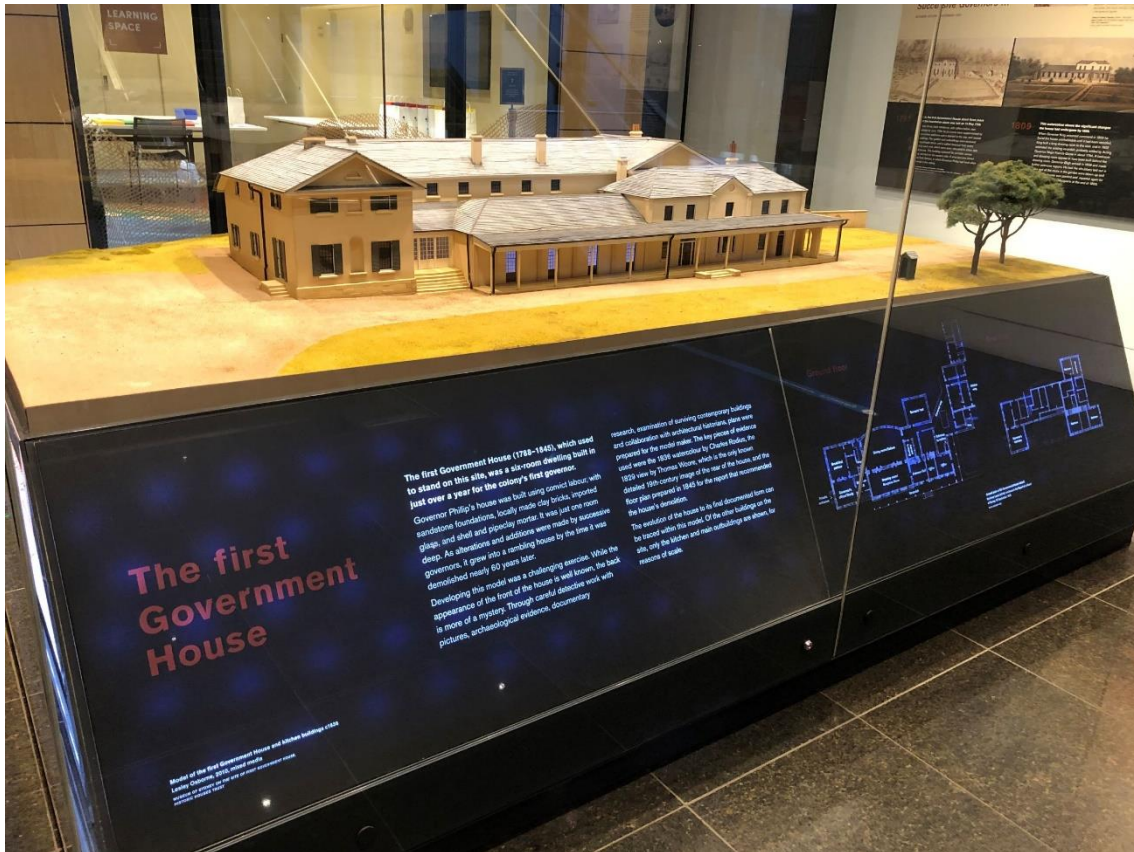
The model of the original Government House in the Museum of Sydney (29 August 2020)

Government House has a long history. When the First Fleet arrived in Sydney from England in 1788, building began on the original Government House. That building served the first nine governors, but due to wear and tear, work began on another building. The current Government House was completed in 1845 and has been used continuously since.