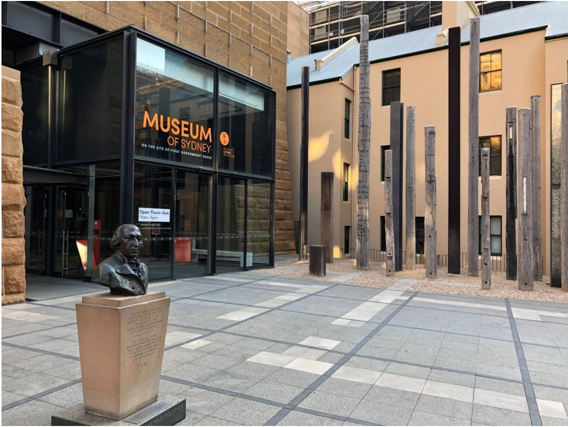
The forecourt of the Museum of Sydney (29 August 2020)

In the forecourt of the Museum of Sydney, white paving stones mark the outline of the first Government House. On one side of the entrance to the Museum, there is a bust of the first NSW Governor, Captain Arthur Phillip, and on the other side are 29 poles representing the 29 Aboriginal clans around Sydney – these remind you of the history of those days.