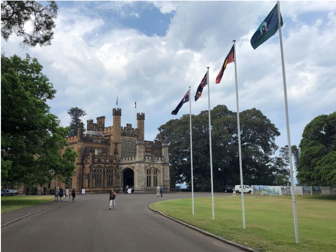
Government House (3 November 2019)

The Government House building is situated at the top of a small hill from which you can look down over the Sydney Opera House. Government House is currently closed to the public because of the COVID-19 situation, but it is usually open to the public on limited days and times. I visited it myself in November as part of the “Open Sydney” event when many historic buildings open up to the public over the weekend. When I visited Government House that weekend, I saw the same room where I had paid my first official visit to Her Excellency just a few days before, and it made me appreciate that Government House Sydney is truly accessible to the general public.